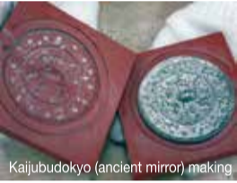
Kaijubo (ancient mirror) making