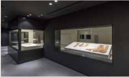
● The mural painting can be viewed through a glass showcase located along the tour route.

On the first floor of Shijin no Yakata, a real mural painting that has been removed from the stone chamber of Kitora Tumulus for conservation is on display for a limited time. To appreciate the mural with even more awareness and interest, gain basic knowledge about Kitora Tumulus and its background period in the exhibition room on the B1 floor before viewing the real mural painting.