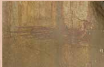
● Directional deity on south wall: Red phoenix

Kitora Tumulus mural paintings have been drawn on the plastered walls inside the tumulus's stone chamber with delicate brush movements. They depict a full-scale celestial map that is believed to be the oldest such map that exists in East Asia, the four directional deities, and Chinese zodiac images with animal heads on human bodies. They are the oldest such examples in East Asia, are cultural properties that have high academic value.