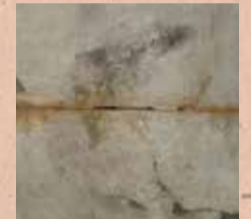
● Ceiling: Celestial map