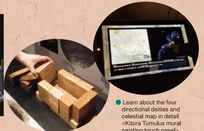
● Learn about the four directional deities and celestial map in detail <Kitora Tumulus mural painting touch panel>