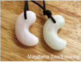
Magatama (bead) making