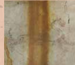
● Directional deity on west wall: White tiger