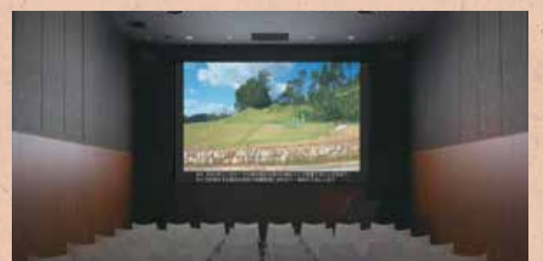
● Watch videos on Kitora Tumulus and ancient Asuka <Theater>