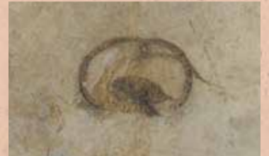
● Directional deity on north wall: Black snake-tortoise