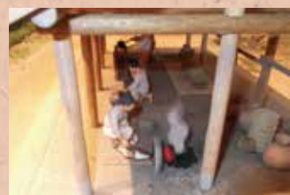
● See what people's lives were like in ancient Asuka in 3D <Diorama>