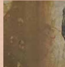
● Directional deity on east wall: Blue dragon