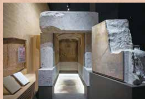
● Real-size stone chamber <Kitora Tumulus model stone chamber>